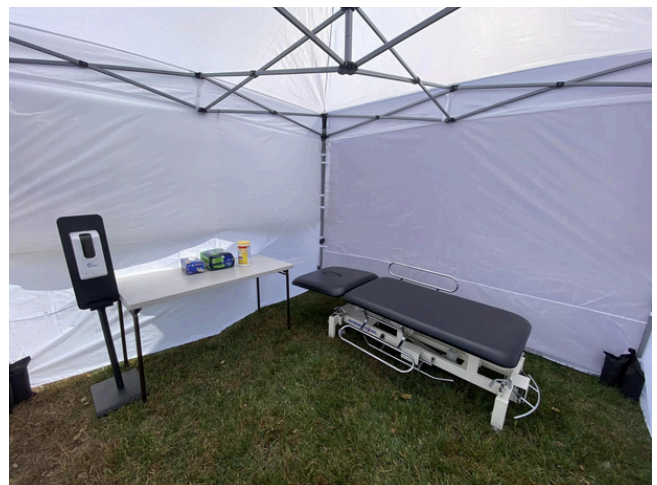
Being included in the community is central to our mission.