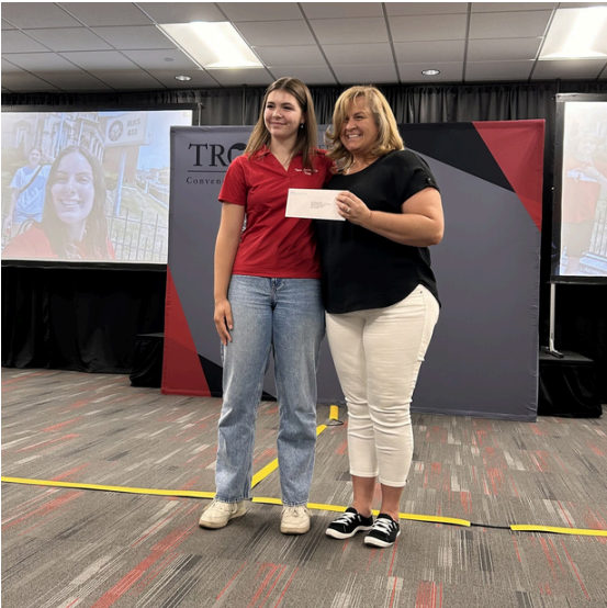
The Troy Foundation presenting us with a grant for Special Olympics.