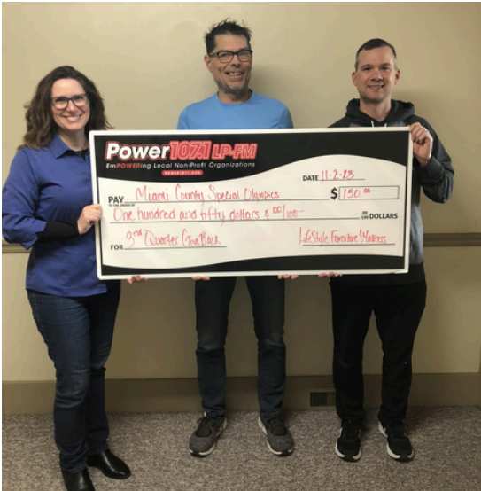
Power 107.1FM hosted us for an on-air interview and donated a check from Lifestyle Furniture and Mattress for Miami County Special Olympics.