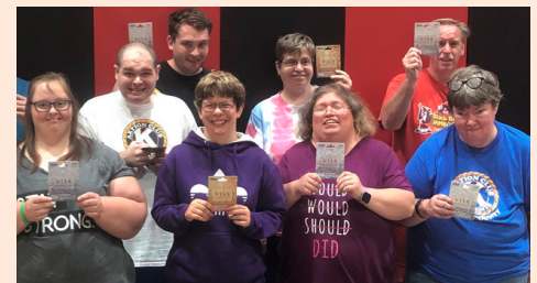
Aktion Club of Miami County members hold gift cards they purchased and donated to victims of the May 2019 tornadoes.